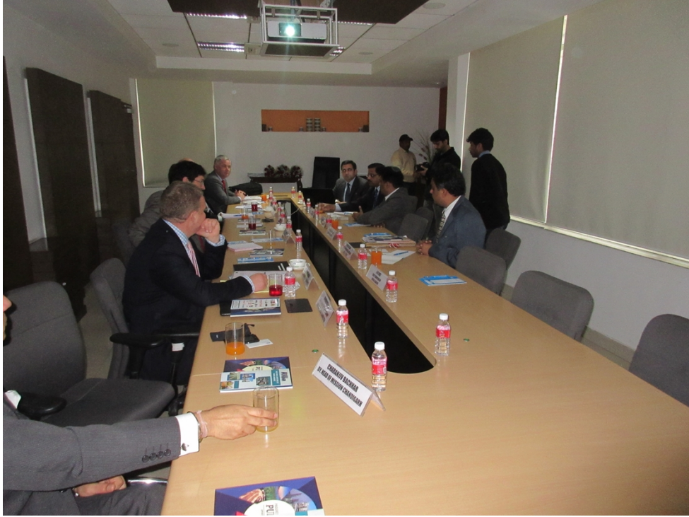
Conference with Confederation of Indian Industry (CII)